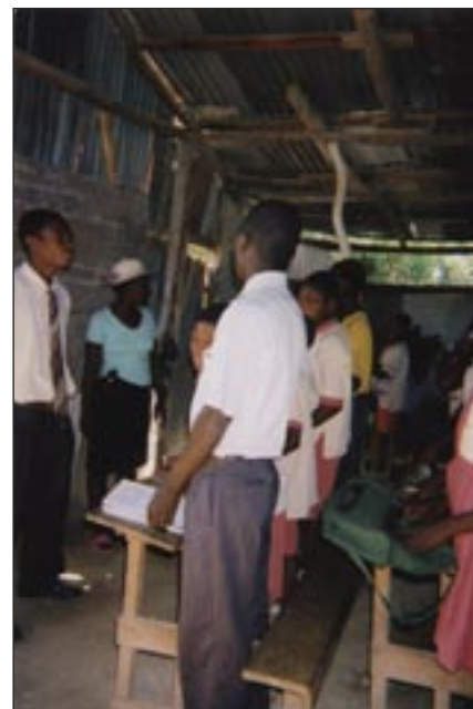
Cabaret School classroom

Unfortunately, Haitians today suffer not only from a weak economy, but also from dramatic deforestation. As recently as 1925, Haiti had 60% of its original forests, but grinding poverty has led people to cut down trees for firewood. Today, only 2% of the country's original forests remain. This has been causing massive soil erosion, which makes farming much more difficult, and flood waters particularly devastating. Floods and mudslides killed over 6,000 Haitians in 2004, and a series of tropical storms killed over 300 people in 2008, and left hundreds of thousands of people without food, clothing, or shelter.