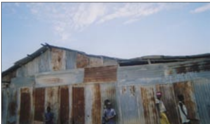
Cabaret School, Haiti